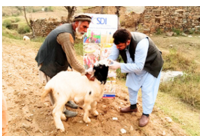
Vet examining livestock

The Mardan team conducted assessments, finalizing 25 beneficiaries out of 40 for LDP Phase VI.