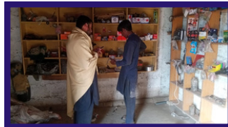
Motorcycle Spare Parts Shop