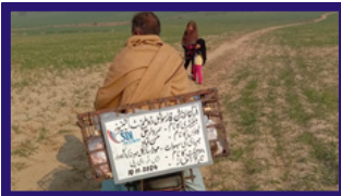
Mobile Sweet Selling Shop