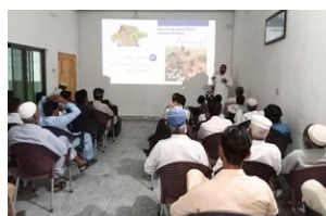
LDP V Training Session