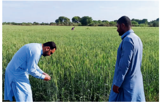
Pic: Agriculture expert assessing fields in Lasbela

An assessment for the upcoming Phase IX cotton crop was conducted in Lasbela, Balochistan, for 35 families, resulting in 23 families being shortlisted after thorough re-verification. With ongoing support, we're propelled to advance our agricultural initiatives, fostering positive transformations within the communities we're dedicated to serving.