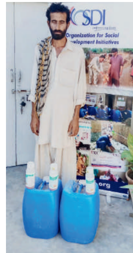
Pic: Organic Fertilizer distribution to ADP Phase VIII beneficiaries in Lasbela