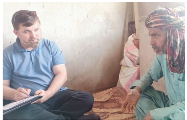
Pic: Senior Associate Manager conducting interviews for beneficiary selection of LDP

Beneficiary selection assessments for Phase VI of LDP have been conducted in Lasbela overseen by the Senior Associate Manager. The field team conducted assessments across ten villages. Selection prioritized widow or female-headed households, families with a per capita income of PKR 4571 or less per month, those facing food security issues, candidates with livestock ownership, and willingness to participate in project activities, with final selection verified by the Monitoring and Evaluation team.