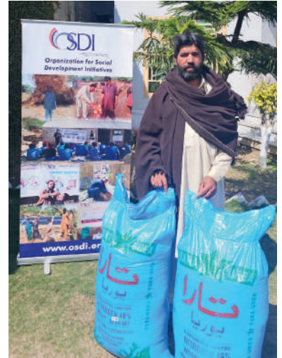
Pic: Synthetic Fertilizer distribution to ADP Phase I beneficiaries in Mardan.