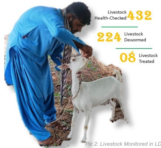
Pic 2: Livestock Monitored in LDP - Phase 5

During this quarter, the 5th Phase of Livestock Development Project (LDP) continued with the regular health check and monitoring activities by the OSDI's appointed vet, in district Lasbela (Baluchistan). Dr. Akhtar – veterinary expert along with the district field team of OSDI checked the health of 432 animals, dewormed 224 livestock and treated 8 critically ill animals against diseases. Furthermore, the vet trained the beneficiaries about breeding, livestock rearing, herd increase, milking, shed preparation & maintenance, fodder mixing and health & hygiene maintenance.