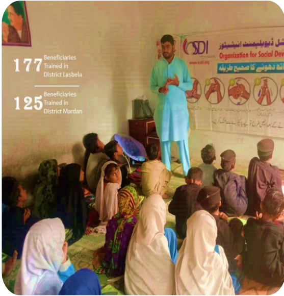
Pic 5: H&H Awareness Session Being held at OSDI's TLC in Mardan