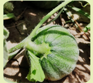
Pic 6: Fresh Produce from OSDI's K.G. in Lasbela

OSDI's team along with the agro expert conducted monitoring visits to the kitchen garden plots prepared in the previous quarter. During this phase, the 24 beneficiaries participating have harvested a land area of 6000 sq. ft. The beneficiaries have chosen to grow ladyfinger, apple gourd and ridge gourd vegetables in their kitchen gardens. Unfortunately, 4 beneficiaries left the project due to some unavoidable reasons.