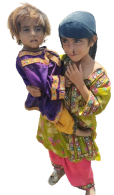
Pic 7: Creating Sustainability for the next Generation

As the reverification process of the vulnerable communities has been completed in district Mardan (KPK), suitable projects for intervention shall begin in the upcoming quarter. In the initial phase, livelihood projects shall be launched to provide means of income generation opportunities to the extremely susceptible families. Besides this, community development programs such as provision of primary healthcare facility, access to primary education, safe drinking water, natural resource management, capacity building on safe health & hygiene practices shall be provided to uplift the people living in these communities to improve their living standards along with creating a food safety net. In district Lasbela (Baluchistan), Small Rural Enterprise Project (SREP) shall begin, 2 Temporary Learning Centers facilitating more than 100 out-of-school children (OOSC) will be constructed, GMCs will be held, etc.