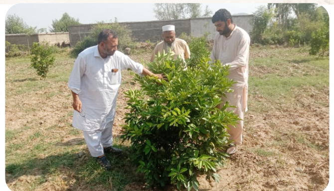
Pic 1: Monitoring Visit of Horticulturist in District Mardan

In FY 2020-2021, OSDI initiated the pilot project of setting up orange fruit orchards in the focused community of Akhundara in district Mardan (KPK). The next year, this project expanded to the community of Biroch. To safeguard the health of the fruit plants given under this project regular follow-ups are conducted every month by the OSDI's appointed horticulturist along with the field office staff of district Mardan (KPK) to monitor the plants growth and check its health condition. In this tenure, OSDI's horticulturist