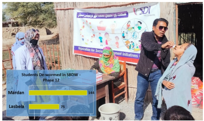
Figure 2: District wise Break-up of Students De-wormed in Phase 12

A total number of 15 health & hygiene (H&H) awareness raising sessions were held in this quarter. Out of these, 12 took place in the focused district of Lasbela (Baluchistan) and 3 were organized in district Mardan (KPK). Altogether, 404 beneficiaries from both the focused districts were trained for safe health & hygiene (H&H) practices by OSDI's Health-care and Field staff teams. The beneficiaries were educated about basic hygiene practices like regular hand-wash especially before and after every meal, brushing of teeth twice a day, daily bathing and hair comb, wearing clean clothes, utilizing clean utensils in kitchen and ensuring proper discarding of litter to avoid damage to overall environment.