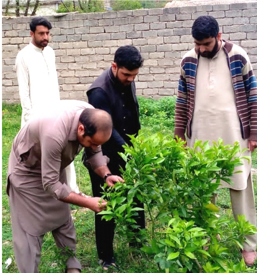
Pic 2: Inspection of Orange Fruit Plants by Horticulturist in district Mardan (KPK)

To keep a close look at the growth and development of the OSDI's first time initiated pilot project of growing fruit farms in district Mardan (KPK), the field team has initiated to make independent monitoring visits to each of these farms on monthly basis. Besides this, OSDI's appointed horticulture expert ensures his visit alongside OSDI's field team after a gap of at least 10 - 15 days after the first monthly visit by the field staff. It is during this quarter, that a few plants in Akhundara village were observed to have termite attacks on them. To safeguard the plant growth nitrophos, zinc, hemic acid fertilizer and insecticide spray was sprinkled. In Biroch, circles were dug around each plant for edging and mulching purpose. Later on, the same fertilizer and insecticides spray was applied on the plants, too. The farmers also had MoU signed in this quarter according to which the farmers shall now take the responsibility of fertilizer application and timely spraying of weedicides & pesticide on their plants. In this way, the farmers shall now become independent caretakers of their fruit plants. Earlier, OSDI was bearing all the finances of agro inputs on behalf of the farmers. During these 2 years of project implementation, the plants have grown up to 3-4 feet tall.