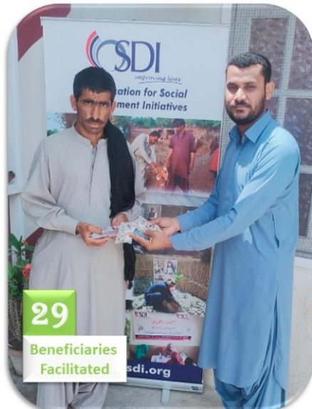
Pic 5: Distribution of vegetables in K.G - Phase 4