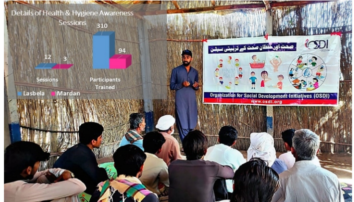
Figure 3: District wise Break-up of Beneficiaries Sensitized in this Quarter