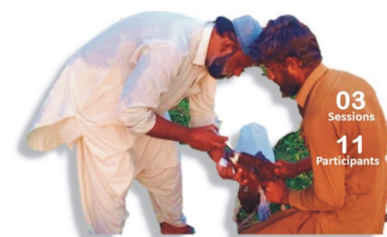
Fig 1: Details of LDP Sessions Conducted in Lasbela

Regular field visits are made by the OSDI's District Mardan (KPK) team; for crop monitoring purposes in the focused communities of Akhundara and Biroch. Since the growth of fruit plants takes atleast a period of 4-5 years before the bearing of fruit, there is ample time for the plants to bloom. It is during these field visits, pest attacks, weedicide growth and plant protection is observed by OSDI's team and the appointed agrarian expert. Interactive training sessions are also conducted in the field to address the frequent queries of these 10 farmers from both the phases.