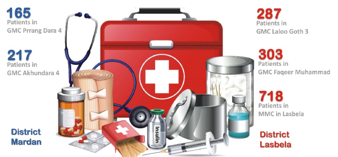
Fig 3: District Wise Breakup of Patients Checked & Treated in this quarter

Besides this, GMCs were held in the targeted villages of Laloo Goth and newly intervened community of Faqeer Muhammad. 239 ailing males and 351 females were facilitated with primary treatment in both these GMCs. In the villages of Akhundara and Prrang Dara, OSDI organized the fourth General Medical Camps (GMCs); in which 382 patients received basic health-care services in district Mardan (KPK).