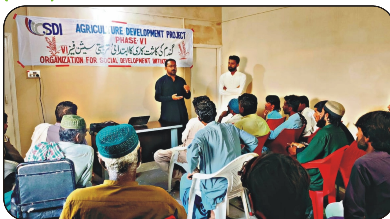
Pic 3: Capacity Building Session for ADP Farmers-Phase 6

Out of the 20 vulnerable farmers selected to participate in this phase one farmer has moved out. Hence, 19 farmers having an aggregate size of 51.25 acres are cultivating wheat crop on their farmland. These farmers have been chosen from 7 extremely susceptible communities of district Lasbela.