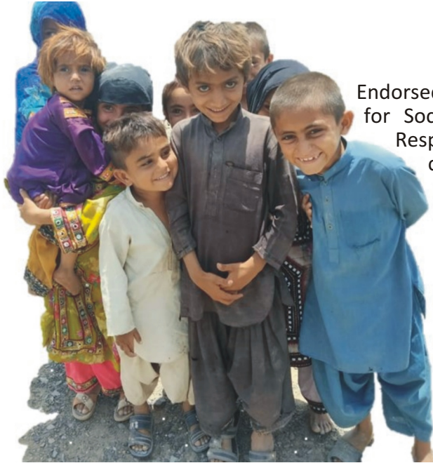
Pic 1: Hope from Baluchistan