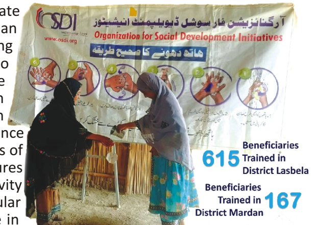
Fig 4: H&H activity conducted District Wise

OSDI's Team has conducted 35 sensitization sessions to educate the people living in the focused communities of district Mardan (KPK) and Lasbela (Baluchistan). These interactive learning sessions were held for student and community engagement to know about the need and importance of safe health & hygiene practices to live a healthy life. The key goal of organizing such awareness raising sessions is to motivate the people living in destitute conditions to improve their lifestyle with little guidance and capacity building. OSDI is determined to improve the lives of marginalized remote inhabitants through preventive measures and safe health practices; that lead to more financial productivity and prosperity across all its targeted communities. Regular trainings on behavior change communications (BCC) is done in