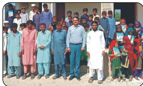
Pic 4: OSDI's Manager Programs along with the District Education Department Team