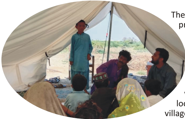
Pic 5: Class ongoing in Temporary Flood Camp of Chamasara

The recent floods caused due to the massive rainfall in the previous quarter, led to a severe destruction of infrastructure in district Lasbela (Baluchistan). Unfortunately, along with the massive loss of lives many things washed away. OSDI's built Temporary Learning Centers (TLCs) of Pini Ladhoo and Chamasara were also wiped out. Members of the School Management Committee (SMC) of Chamasara gathered to set-up a tent to continue the learning process; whereas, in Pini Ladhoo the SMC members had a temporary location set-up with wood logs. OSDI's TLC built in Sayarani village is also visited by the OSDI's field team for monitoring purposes along with the other two TLCs.