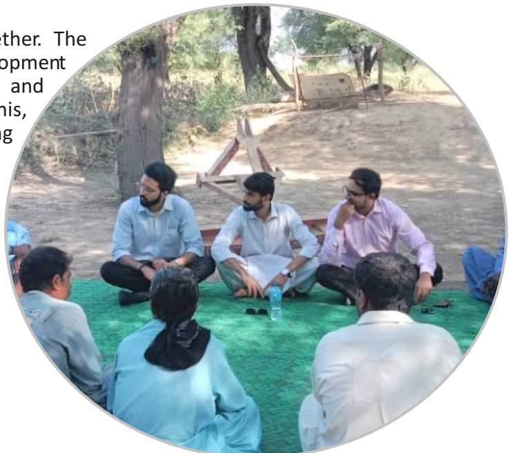
Pic 2: Interviewing beneficiaries in District Lasbela

The PCP team had one-to-one discussions with the beneficiaries and enquired about their well-being after joining the OSDI's poverty alleviation programs. Overall, it was a productive visit and PCP team appreciated the contribution of OSDI in sustainability creation within these poverty struck communities.