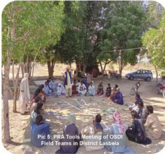
Pic 5: PRA Tools Meeting of OSDI Field Teams in District Lasbela