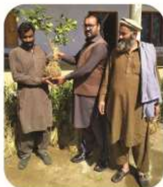
Pic 1: Distribution of Orange Fruit Plant in District Mardan

20 farmers facilitated to grow wheat crop in the 3rd Phase of ADP in district Lasbela, have been supported with urea bags in this quarter; to cultivate healthy crop yields. Each farmer received total 6 urea bags in 2 separate rounds.