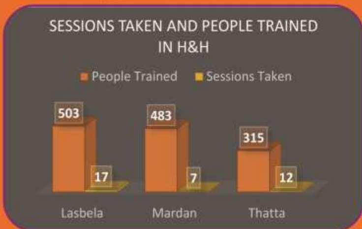
Fig. 4: Sessions Taken and People Trained in H&H