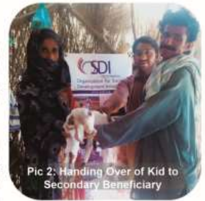
Pic 2: Handing Over of Kid to Secondary Beneficiary

During the 3rd phase of LDP, 20 susceptible families from the focused community of Chamasara in district Lasbela received 40 pregnant does and 10 bucks. 7 of these does gave birth to 7 male kids which reaching the age bracket of 2 to 4 months were passed on to 7 more vulnerable beneficiaries; thus creating a multiplier effect.