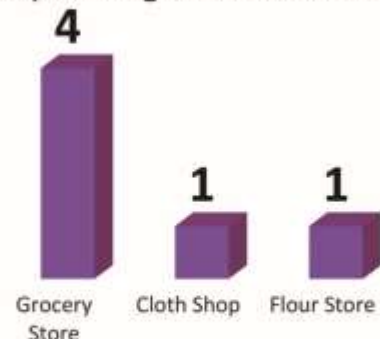
Fig. 2: SREP Beneficiaries for Upcoming Phase in District Mardan