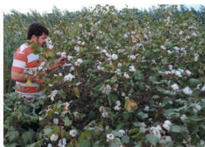
Cotton Crop being inspected by LAP Manager

The first phase of Agriculture Development Project (ADP) had been initiated in district Lasbela (Baluchistan) during the previous quarter in which 20 beneficiaries had been selected to grow cotton crop on their farmland. Provision of necessary resources such as seeds, DAP and urea fertilizers had been given to the farmers to ensure healthy growth of crop. To build upon the capacity of the farmers, OSDI arranged two advance training sessions of the beneficiaries in this tenure.