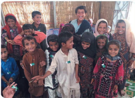
On the path towards Sustainability

To explore new horizons for financial empowerment, OSDI plans to implement a sub-project entitled "Corporate Farming" in district Lasbela (Baluchistan) and Thatta (Sindh) in the upcoming quarter. This project would be an extension of Agriculture Development Project (ADP).