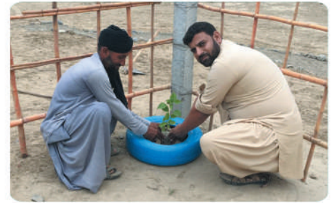
Plants Donated by HNP sowed at TLC in Sayarani Goth

OSDI received a generous donation of 100 plants from Hingol National Park (HNP) in district Lasbela (Baluchistan) during the month of July 2019. The variety consisted of Paras-Pipal plants, Madras Thorns, China Roses, Sheesham also known as Indian Rosewood, Apple Trees and Cococarpus plants. 80 plants have been sowed in the newly constructed Temporary Learning Center (TLC) of Sayarani Goth and the remaining 20 plants have been given for the beautification of a masjid within the local community.