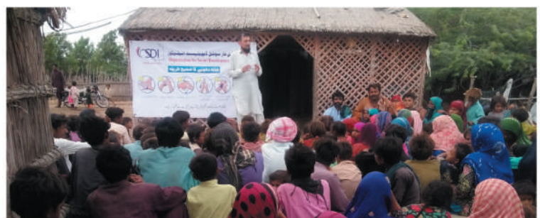
First Phase of H&H awareness session at Yaqoob Jokhio Goth

Keen focus was made by OSDI on organizing community awareness raising and mobilization sessions on the importance of safe health & hygiene practices in this quarter. Training sessions and demonstrations on various techniques involved for proper hand-wash, teeth brushing, shampooing of hair, bathing, etc. were briefed to the local audience amongst all three focused districts of OSDI. To make the learning process interactive videos and community awareness cartoons like Meena was shown to the villagers. This enhanced the learning as the target audience which were mainly the children and females got engaged and motivated to act as the agents of change for the benefit of the entire community.