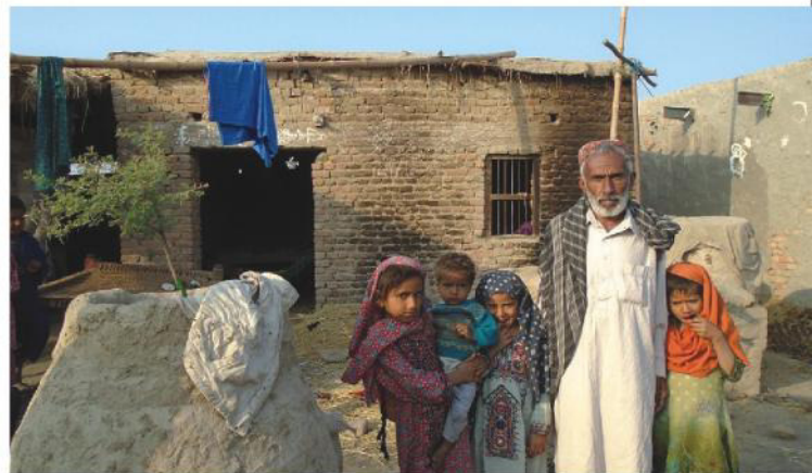
Glimpse of Rural Life

To serve the purpose, OSDI prepared a sustainability model comprising of 3 key areas i.e. Livelihood Assistance Program (LAP), Community Development Program (CDP) and Food Security Program (FSP).