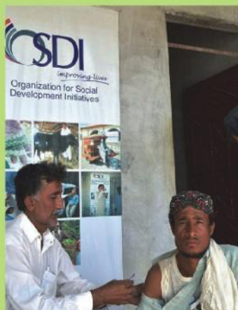
Patient being treated at U.C. Hada Sethar MMC 2

“OSDI aims to create positive difference by providing sustainable development strategies for poverty alleviation in rural communities of Pakistan”