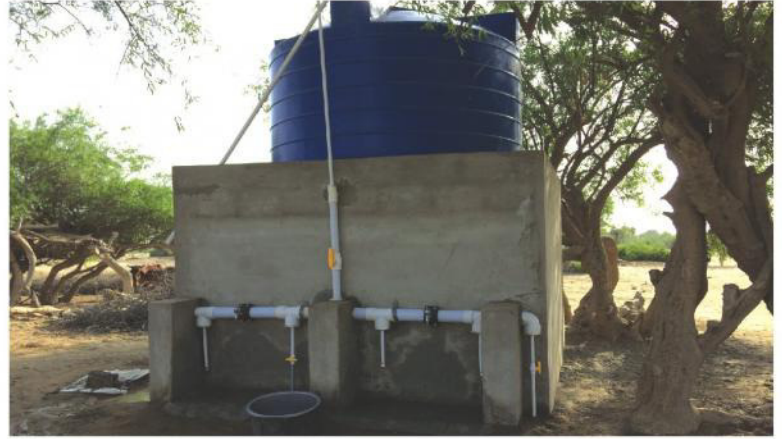
SWP and Water Storage Tank provided by OSDI

Currently, the water-tank base is being constructed and soon a plastic water storage tank having the capability to store 6,000 liters of water shall be placed in this village.