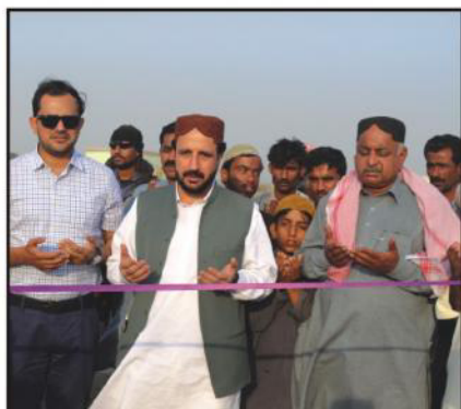
Founder Trustee (HJWF) and Manager Programs (OSDI) during the SWP inauguration ceremony

Overcoming the water inaccessibility and shortage in the focused communities of district Lasbela (Baluchistan), OSDI