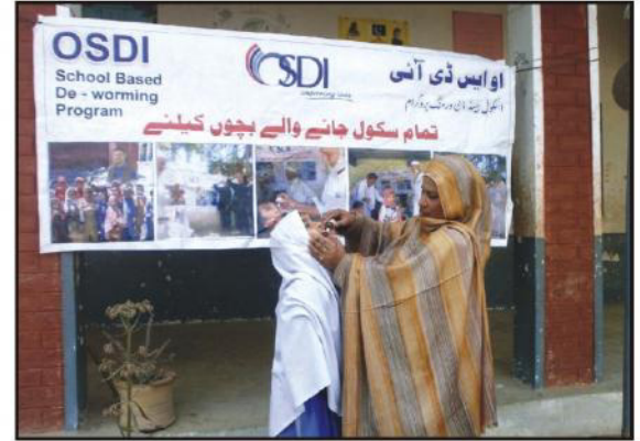
Student being de-wormed in district Mardan

After digging bore in the concerned settlements of Faqera Goth, Bano Hussain Goth and Miru Suleiman Goth solar panels were set up to extract fresh water. To store the excessive water OSDI has also placed storage tanks having the capacity to keep 6,000 liters of water.