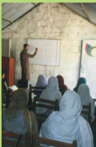
Students of TLC Arab Seray engaged in acquiring knowledge

“OSDI aims to create positive difference by providing sustainable development strategies for poverty alleviation in rural communities of Pakistan”