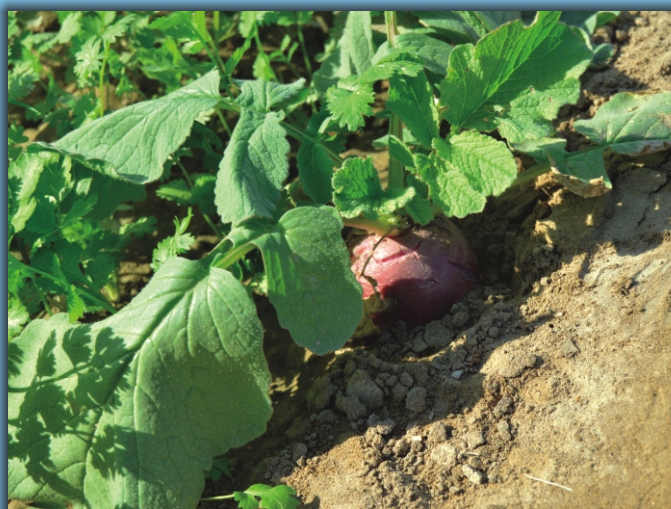
A glimpse of fresh and healthy home-grown turnip in the KG of Miru Suleiman village

In the deprived focused community of Miru Suleiman, district Lasbela (Baluchistan), OSDI initiated Kitchen Garden (KG) as a pilot project during the month of September 2017. Under this project, 20 vulnerable households have been supported with seedlings and seeds of Spinach, Coriander, Turnip, Brinjal and Green Chillies. Few of the beneficiaries have preferred to grow Maize for fodder preparation of their livestock.