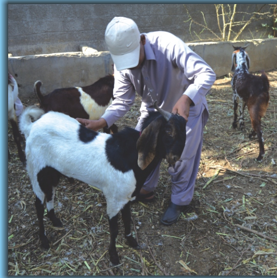
OSDI's appointed veterinary doctor checks the physical health of the livestock prior to purchase

The health of each animal given was thoroughly checked and approved by OSDI's appointed veterinary doctor prior to its purchase. All beneficiaries have been donated 2 does for herd increase and food security whereas 2 bucks per village have been given away for reproduction. OSDI also trained the beneficiaries about best animal rearing practices including fodder preparation for fat-fattening, silage preparation, shed maintenance and disease prevention, etc. to keep the livestock distributed healthy.