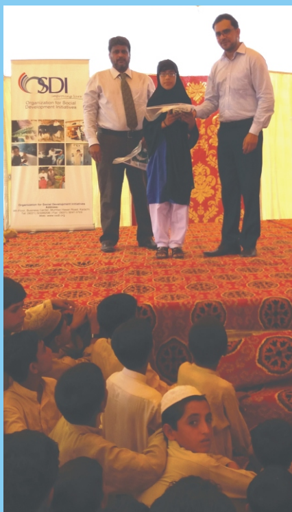
Senior management of OSDI distributes goody bags to students of GBHS Wayaro

O SDI achieved its two major milestone projects of education during this quarter; inauguration of the newly revamped Government Boys High School (GBHS) building in U.C. Wayaro and inauguration of the newly constructed academic block building of Frontier Constabulary Public School (FCPS), Bela in Baluchistan.