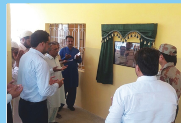
A view of Inauguration ceremony of GBHS Wayaro