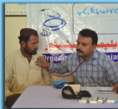
An ailing patient being treated at OSDI's GMC held in Peprani, District Lasbela (Baluchistan)

Majority of the patients complained of RTI (Respiratory Tract Infection), GIT (Gastro Infection Tract), Anemia and Muscular Pain. It can be concluded that these illnesses might be an outcome of the malnutrition and unhygienic conditions due to the poor living standards.