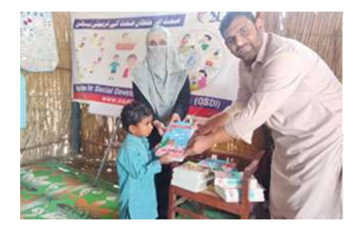
H&H session in TLC of Qambrani

On 13th April 2022 (Wednesday), OSDI's Team Leader for district Lasbela (Baluchistan) donated course books to the management of the Community School in Sangal. This educational facility is being run under the supervision of the Hingol National Park (HNP), a close ally of OSDI. Approximately, 30 students acquiring education at this facility shall benefit from the donation given. The community of Sangal is a revenue village in the union council of Lyari. This settlement is approximately 120 kms away from the OSDI's field office in Utthal.