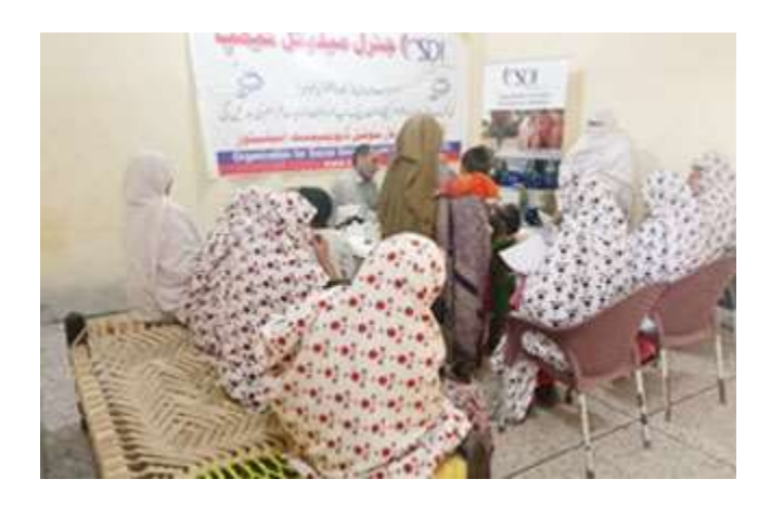
4th GMC organized in Akhundara Community

#livelihood #agriculture #farmers #monitoring