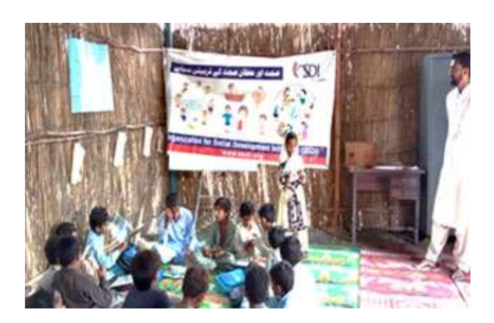
H&H Awareness Session in TLC Qambrani

#education #primaryeducation #school #coursebooks