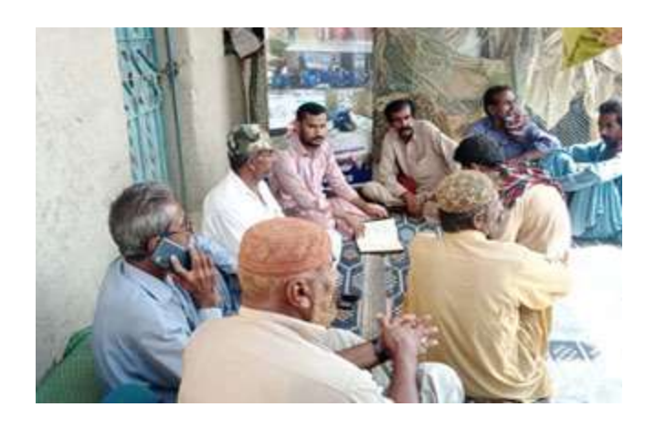
BBCM organized in Husain & Abdul Sattar Angarya villages

In the west, of union council Lakra lies the revenue village of Orki in district Lasbela (Baluchistan). On 22nd October 2022 (Saturday), OSDI's Field team visited the newly selected focused communities of Hussain and Abdul Sattar Angarya to conduct Broad Based Community Meetings (BBCMs). There are nearly 18 families residing in Abdul Sattar Angarya village and 25 households in Hussain Goth. Representatives of both the communities raised issues on the inaccessibility to education, poor infrastructure and lack of income generation opportunities. OSDI's representatives thanked the community members for their time and shared details about the past interventions and their outcomes.