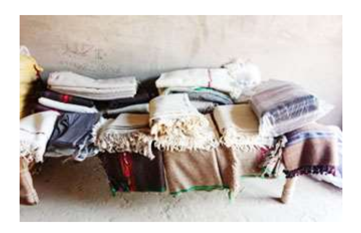
Monitoring Field Visit to SREP beneficiaries

#livelihood #agriculture #farming #fruitorchard