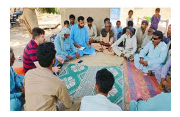
BBCM organized in villages of Union Council Wayaro

#teachersday #motivation #happymoment #hygiene #health #awareness #learningisfun #education #students