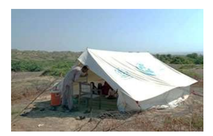
Visit to Flood Affected TLCs in Pini Ladhoo and Chamasara

#smallbusiness #capacitybuilding #livelihood #monitoring