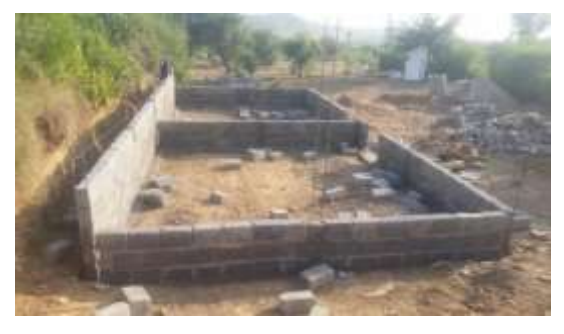
Nakhtar Banda village.

It is expected that more families shall start preparing kitchen gardens on their own once the gardens of OSDI beneficiaries start blooming.