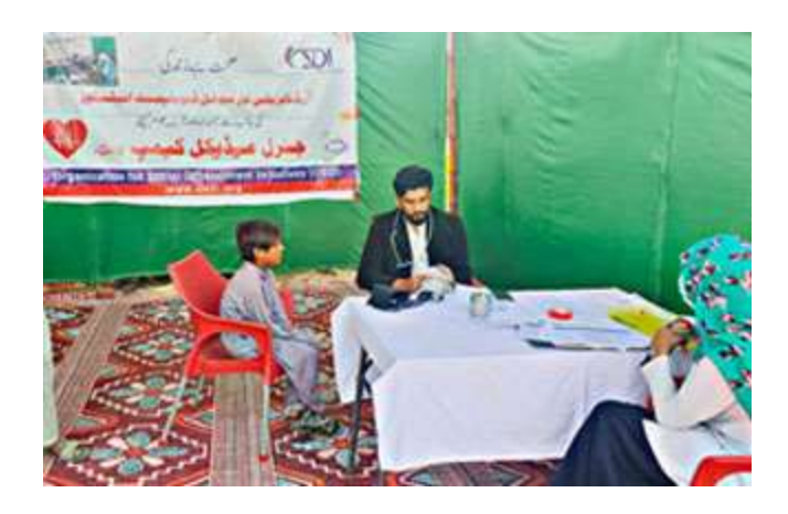
1st GMC organized in village Faqeer Muhammad

#primaryeducation #school #midterms #exams #students #assessments