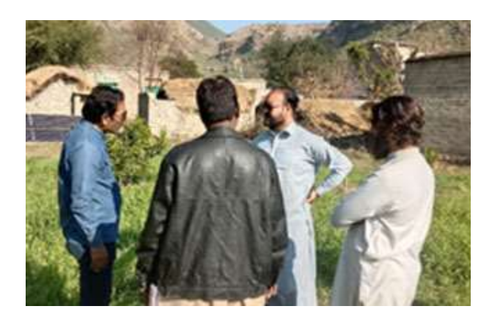
Visit to Orange Fruit Orchards in Mardan

#primaryeducation #monitoring #school #management