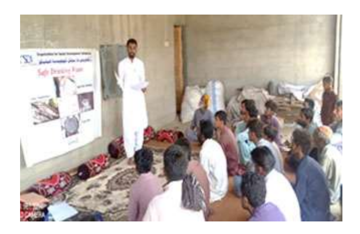
Water Purification Tabs Distributed in Lasbela

On 21st September 2022 (Wednesday), OSDI's Health team visited 8 focused communities of Haji Ibrahim Goth, Ibu Sheikh, Chib Sheikh, Sayarani, Laloo Goth, Qambrani, Essa Goth and Muhammad Dooda Goth in district Lasbela (Baluchistan). During the one-day visit, a total number of 13 awareness raising sessions on the importance of water purification and benefits of safe health & hygiene practices were conducted. Altogether, 300 beneficiaries from 277 households attended the knowledge sharing sessions. The beneficiaries were taught about water purification method through the use of aqua tabs. A total number of 4140 aqua tabs were distributed amongst the beneficiaries which would cater to a population size of 1939 individuals. OSDI's Health team also distributed milk and biscuits amongst each family. #water #safewater #health #hygiene #capacitybuilding