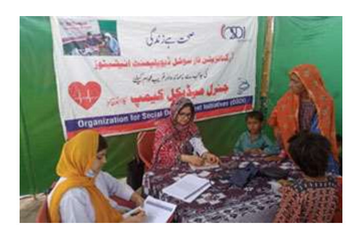
3rd GMC in Sathi Jatt community

On 1st April 2022 (Friday), OSDI's Health Team in collaboration with the District Health Department organized a General Medical Camp (GMC) in the focused vulnerable community of Sathi Jatt, in the union council of Kaghan in district Thatta (Sindh). The village lies at a distance of approximately 30kms from Gharo city. During the one day GMC, 157 patients were checked and treated by the OSDI's appointed doctors and paramedical staff. Amongst the patients, 56 were males and 101 were females. Majority of the patients complained about Gastro Intestine Tract Infection (GIT). Amongst the elderly patients, Respiratory Tract Infection (RTI) was the most common disease. To create awareness about safe health & hygiene (H&H) practices, a total number of 51 people were trained during the 4 sessions.