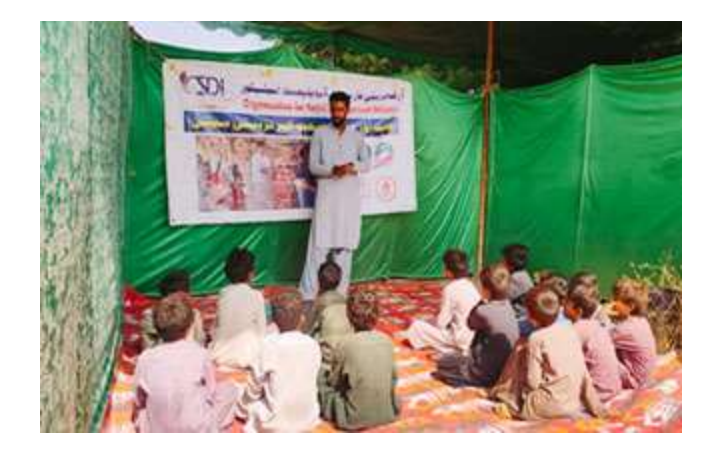
OSDI's team held 3rd GMC in Laloo village

#education #educationforall #students #teacher #school