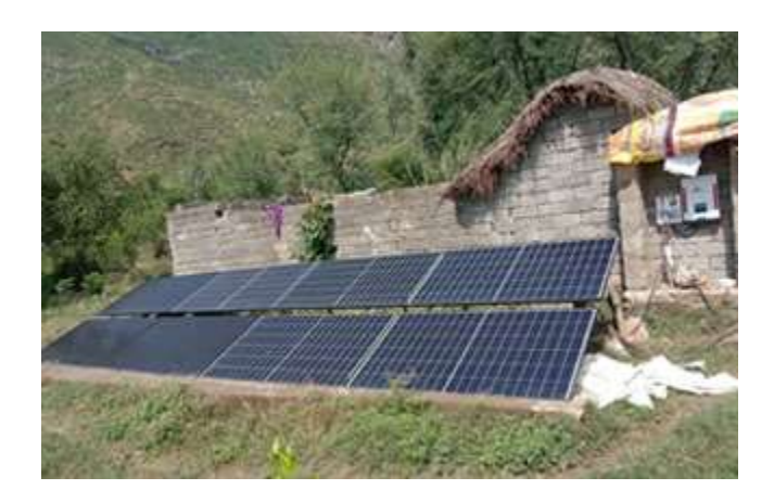
Routine Field Visit to Fruit Orchards

#primaryeducation #schoolmanagement #education #teacher #studentsenrollment