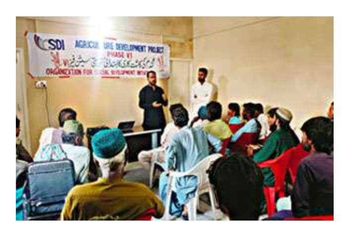
Farmers Training for ADP - Phase 6

#agriculture #livelihood #farmers #training