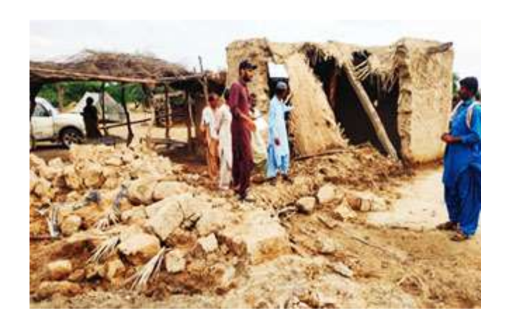
Visit to New Flood Affected Communities

#floods2022 #disasterrelief #damagecheck #ration #medicines #foodsecurity #emergencyrelief