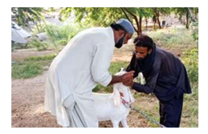
Health of LDP - Phase IV Animals Checked

#plants #fruit #orange #horticulture #livelihood