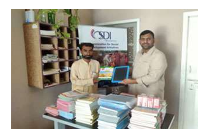
Course Books Donated in the Community School of Sangal

On 13th April 2022 (Wednesday), OSDI's Team Leader for district Lasbela (Baluchistan) donated course books to the management of the Community School in Sangal. This educational facility is being run under the supervision of the Hingol National Park (HNP), a close ally of OSDI. Approximately, 30 students acquiring education at this facility shall benefit from the donation given. The community of Sangal is a revenue village in the union council of Lyari. This settlement is approximately 120 kms away from the OSDI's field office in Utthal.