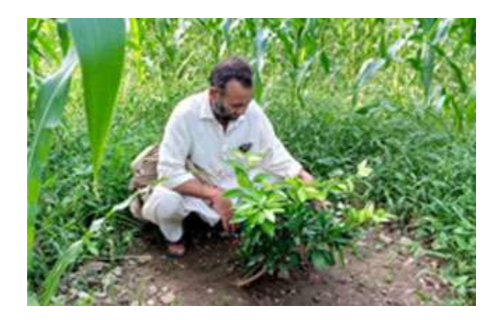
Pesticide Spray on Fruit Orchards of Mardan

#smallbusiness #financialmanagement #capacitybuilding #livelihood