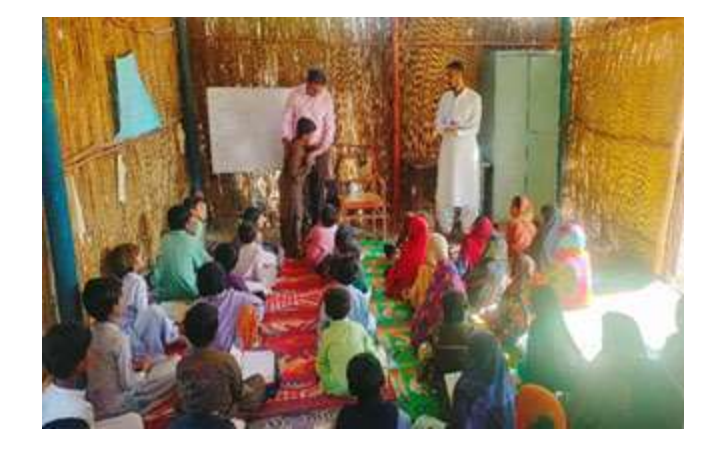
Monitoring Visit of TLC in Qambrani

#smallbusiness #livelihood #monitoring #financialempowerment