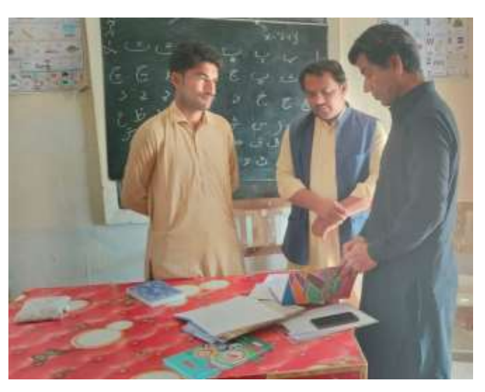
vowed to share his support.