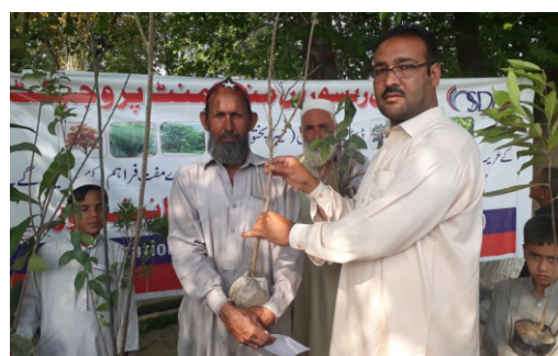
Plants being distributed in District Mardan under NRM project

The first phase of plantation activity was initiated in Mardan district. During the plant distribution activity held in April 2018, nearly 1940 seedlings were donated within the vulnerable communities of Shahturi, Surkhabi and Akhundara. Each household within these villages was facilitated with 5 fruit and