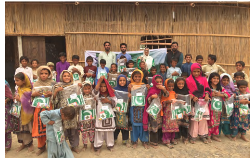
Independence day celebration at TLC Chib Sheikh

Students of OSDI's second TLC in Arab Seray community of district Mardan were facilitated with school uniforms to promote equality amongst them. It was also for the first time 'Parents Day' was celebrated in this school. Due to OSDI's constant advocacy the government has accepted to construct a proper school in Arab Seray community and make it functional. As previously committed, students of Faiz-ul-Islam school were also provided with uniforms.