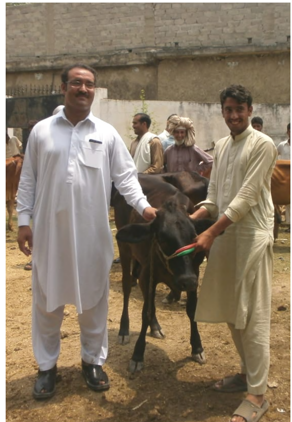
Distribution of livestock in District Mardan

Vaccination of livestock in district Mardan has once again took place against the "Ghunddari disease". Nearly 461 cows, oxens and buffaloes have been inoculated with the precautionary medicine during this tenure.