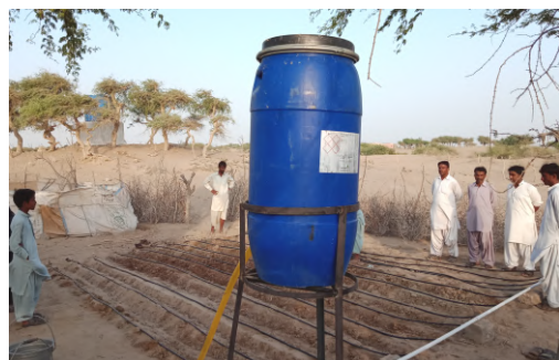
Drip Irrigation System implemented in Moosa Goth

To better facilitate the people living in our focused communities OSDI initiated to