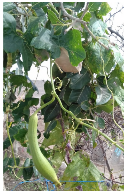
Bottle Gourd plant in Miru Suleiman Goth

Vegetable seeds have also been distributed amongst the students of Government Boys High School in Wayaro, Government Middle School in Ahora and TLC of Chib Sheikh on 14th August 2018. The goody bag provided to each student consisted of few sweets, national flag, badge, pencil and a packet of vegetable seeds. Brinjal, cucumber, spinach, coriander, turnip, carrot, bottle gourd, lady finger, lettuce, raddish and bitter gourd were the vegetable seeds given away.