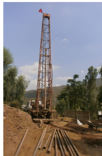
Boring ongoing in Akhundara

As for the water project of Kareer Goth it is in the final phase of completion as of now.